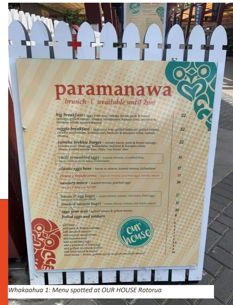
Whakaahua 1: Menu spotted at OUR HOUSE Rotorua